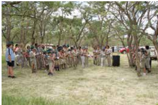
Cubs own with 1st Ladysmith Lions in charge